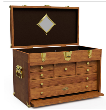
American Cherry, Brown Felt, Brass Hardware