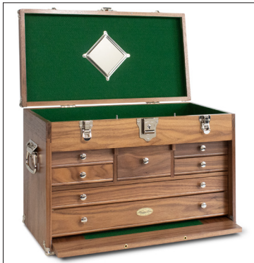
Natural Walnut, Green Felt, Nickel Hardware