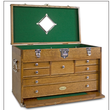
Golden Oak, Green Felt, Nickel Hardware