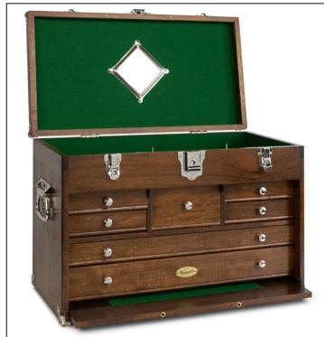
Dark Walnut, Green Felt, Nickel Hardware