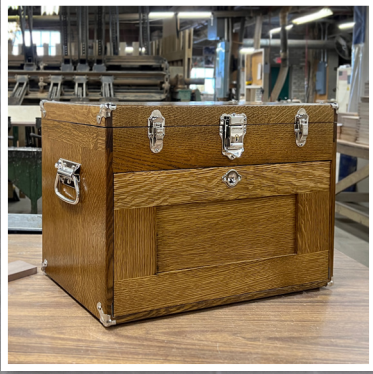
Golden Oak, Green Felt, Nickel Hardware