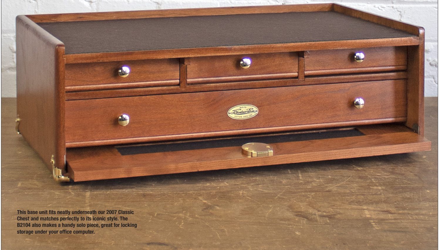
This base unit fits neatly underneath our 2007 Classic Chest and matches perfectly to its iconic style. The B2104 also makes a handy solo piece, great for locking storage under your office computer.