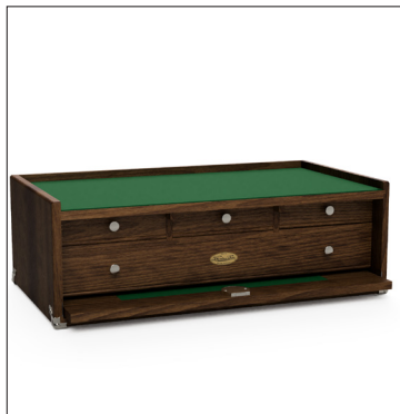
Dark Walnut, Green Felt, Nickel Hardware