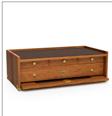
American Cherry, Brown Felt, Brass Hardware