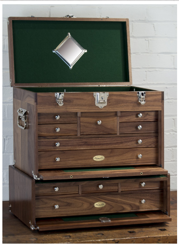
Natural Walnut, Green Felt, Nickel Hardware. Shown with a 2007 Classic Chest.