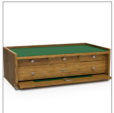
Golden Oak, Green Felt, Nickel Hardware